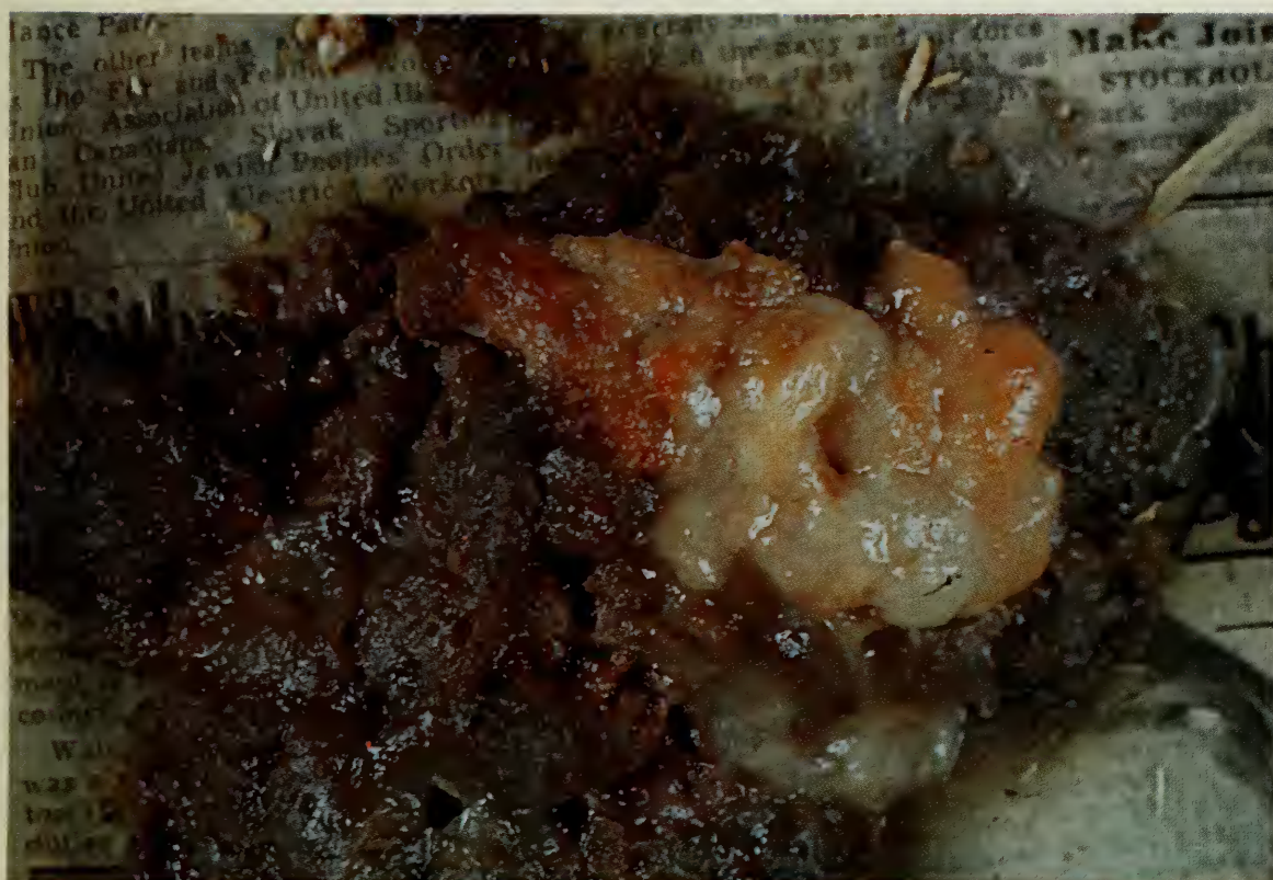
Fig. 6. Virus enteritis — stool sample with typical mucus "slug" on top.